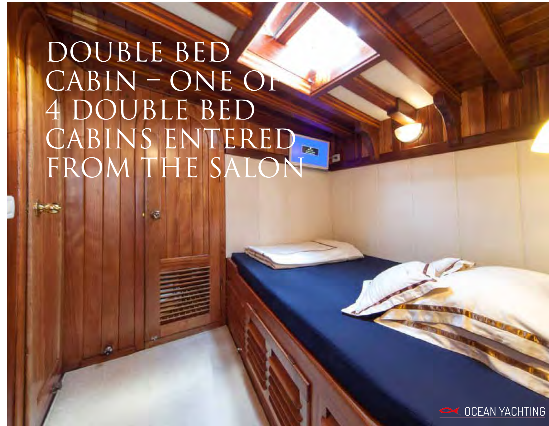
DOUBLE BED CABIN – ONE OF 4 DOUBLE BED CABINS ENTERED FROM THE SALON