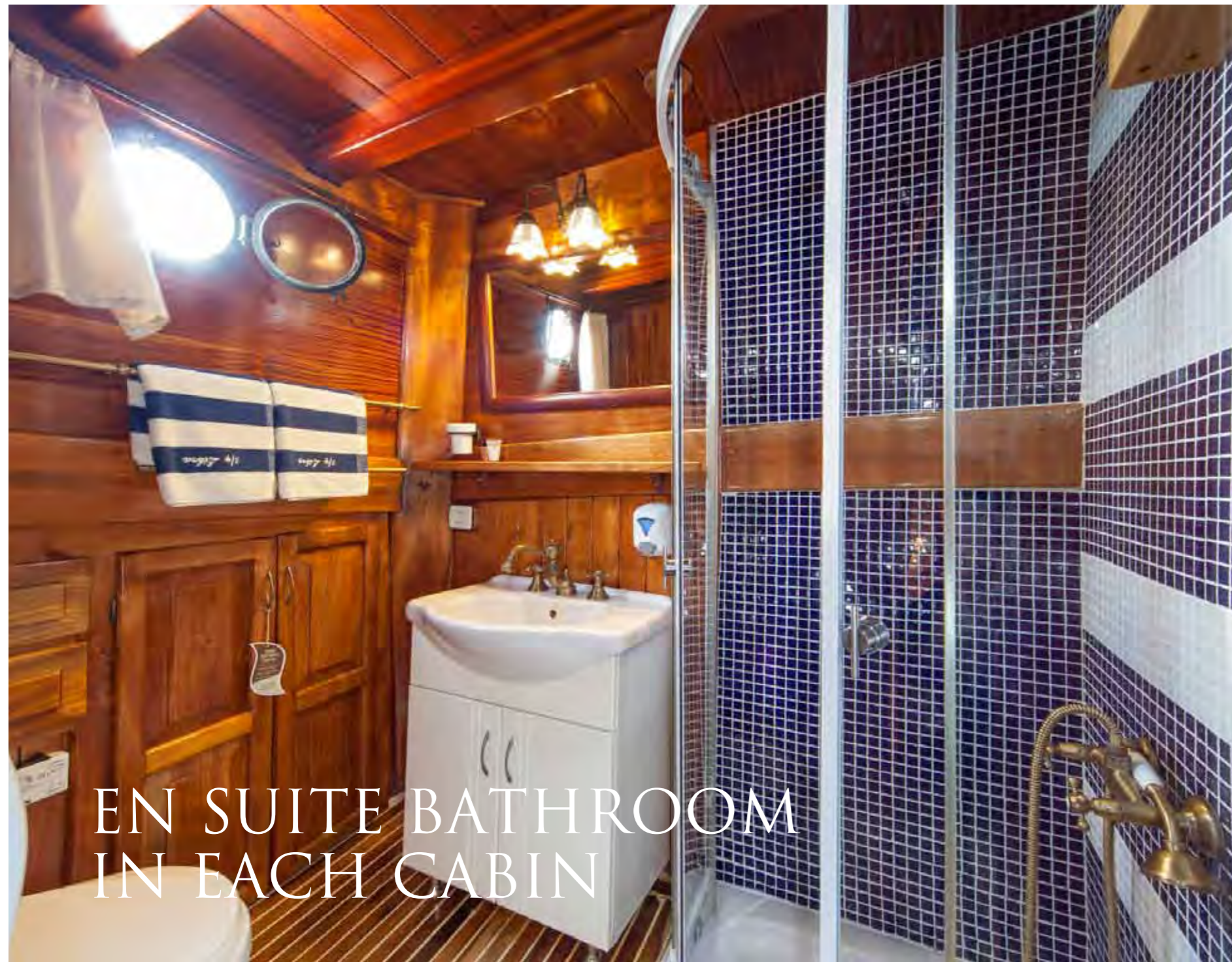
EN SUITE BATHROOM IN EACH CABIN