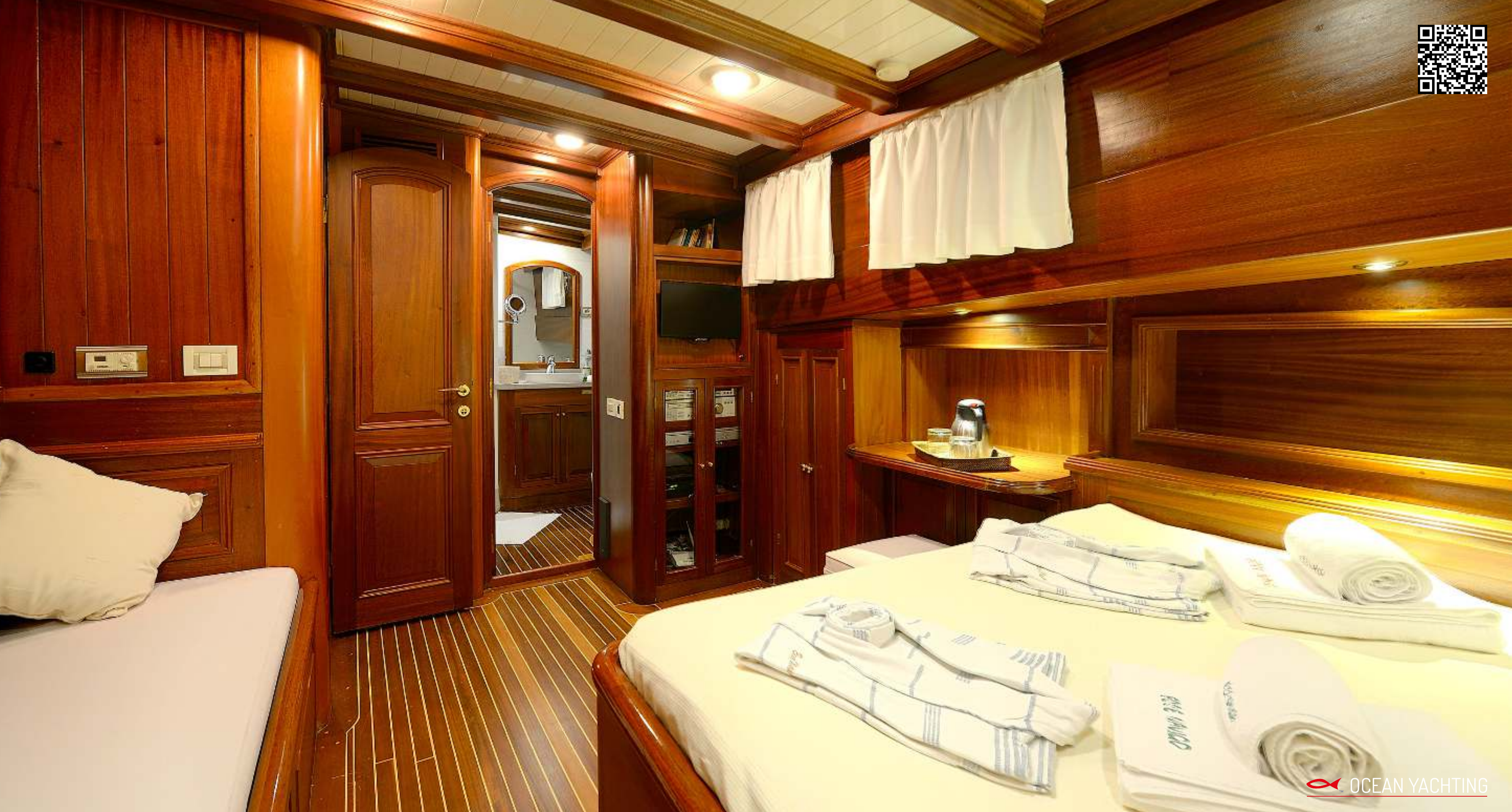
Front Left Room