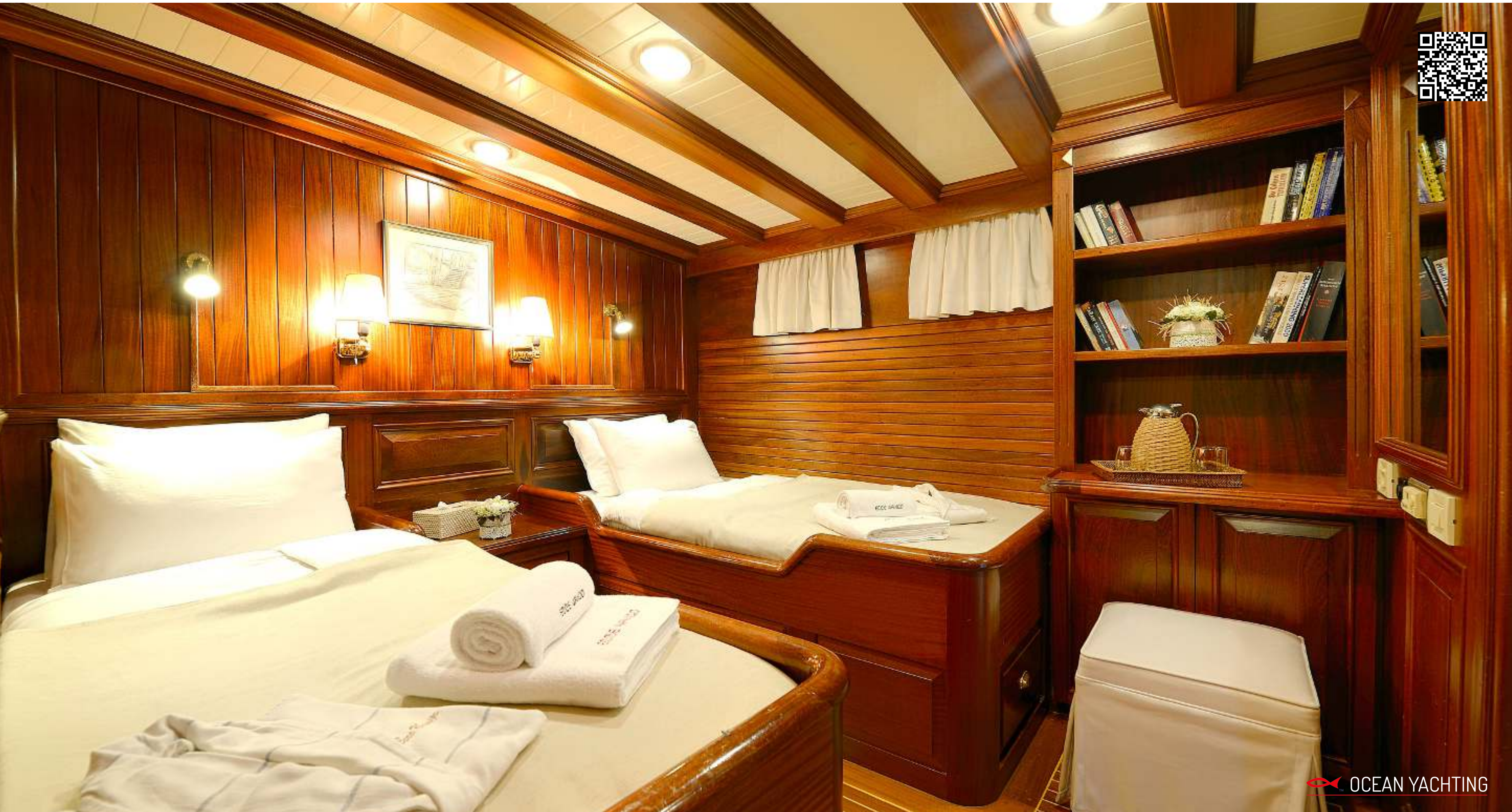
AFT Right Single Room