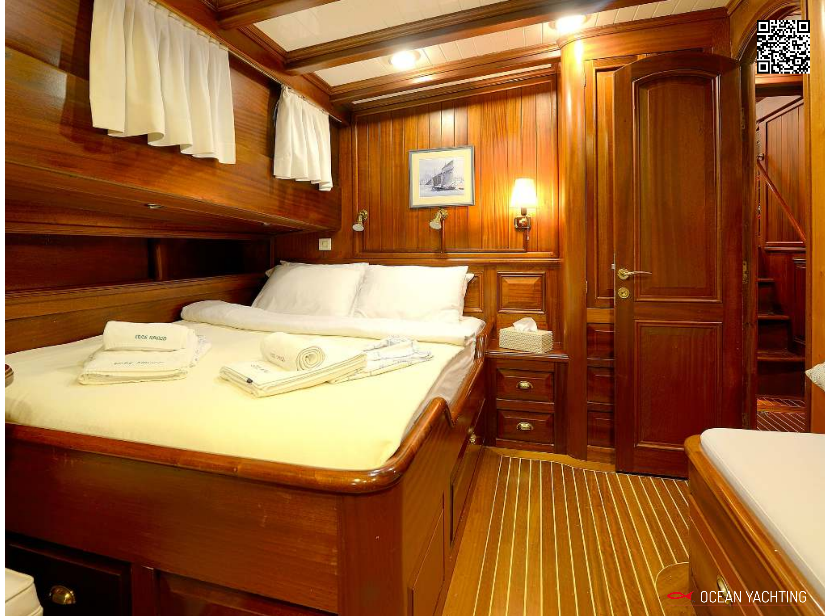
Front Right Room and Bathroom