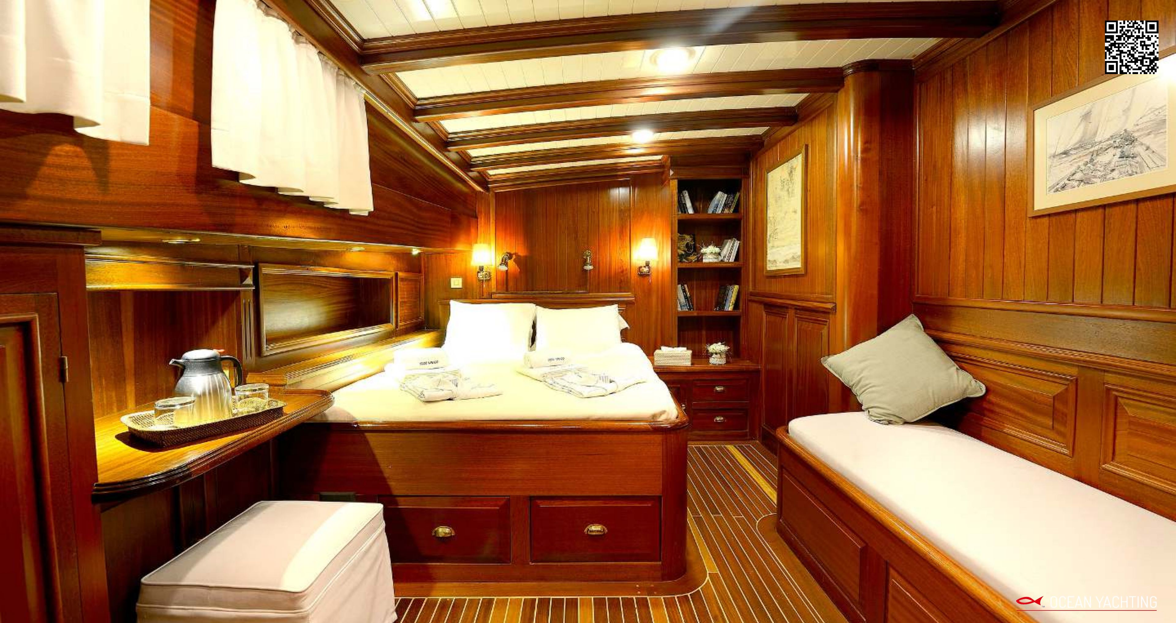
Front Left room