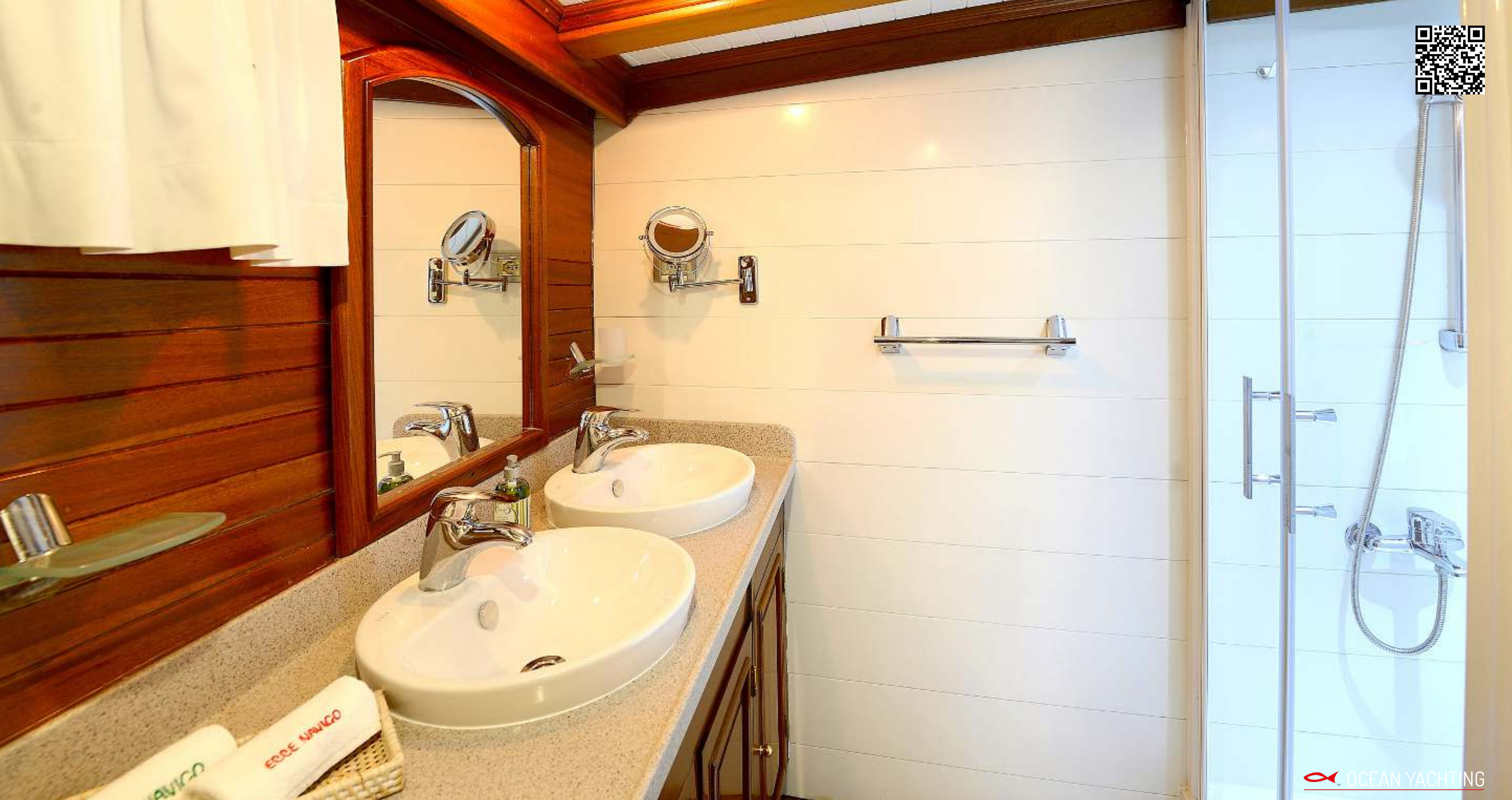
Master Room Bathroom