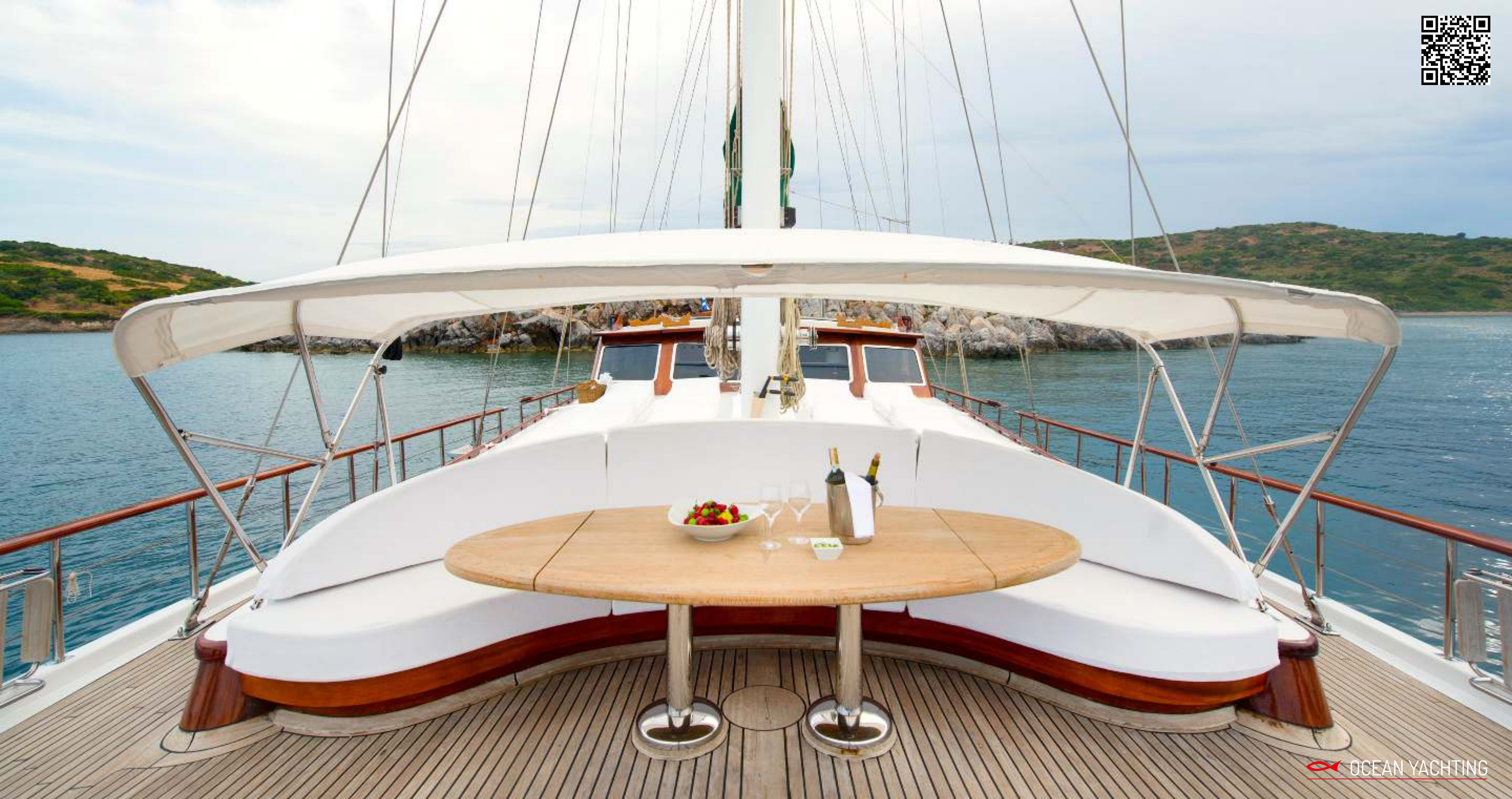
Front Seating Area