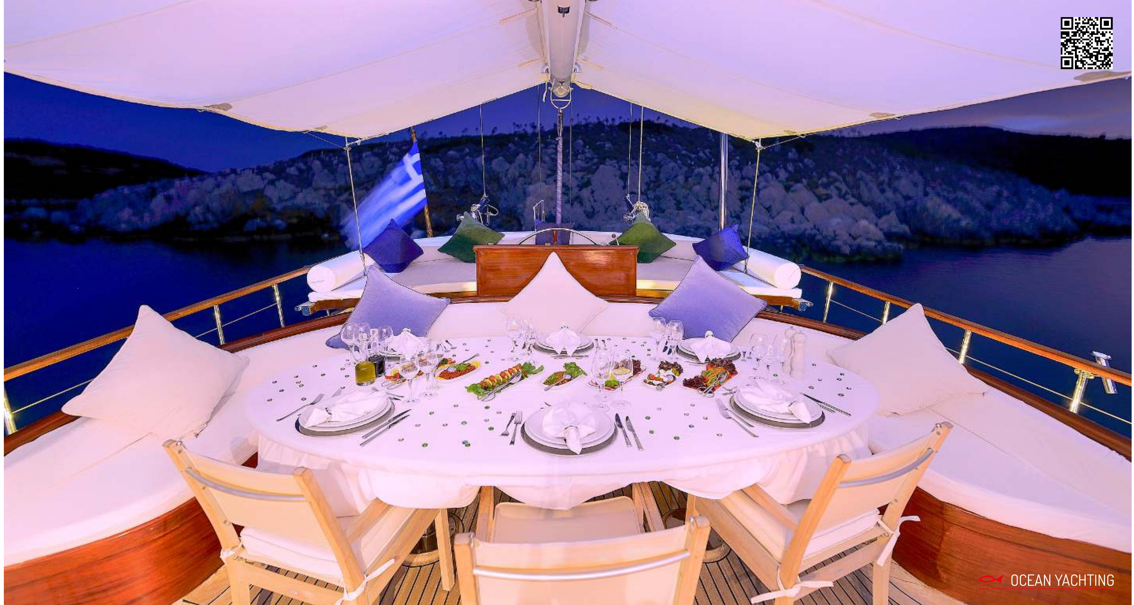
AFT Dinner Table