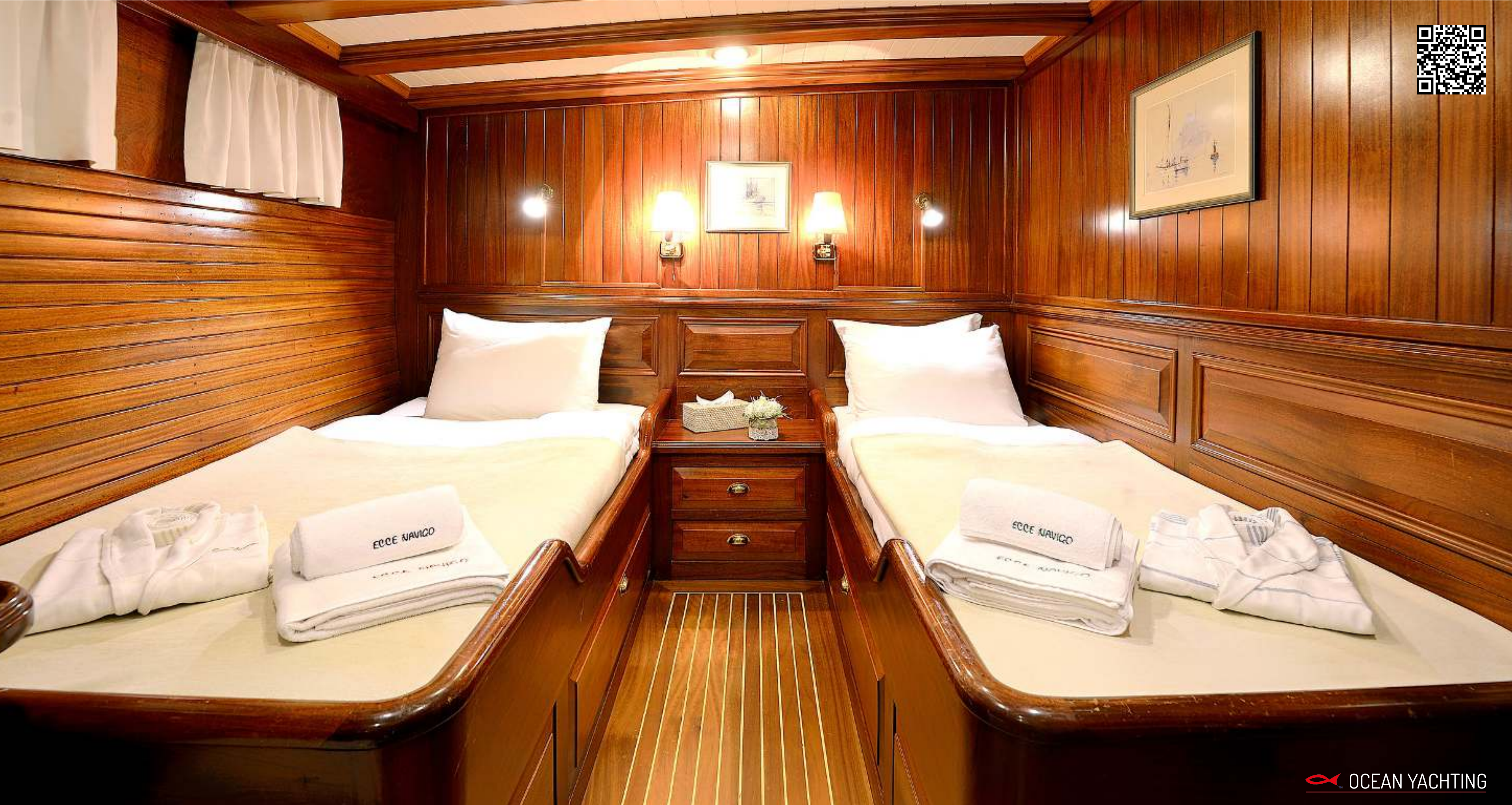
AFT Left Single Room